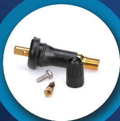
Rubber Snap-In #20018

Includes: plastic sealing cap, screw, brass valve core and rubber snap-in stem.