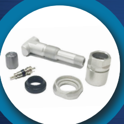
Aluminum Adjustable Angle #20049

Includes: plastic sealing cap, nickel-plated valve core, adjustable aluminum clamp-in valve stem, hex nut, aluminum seat and rubber grommet