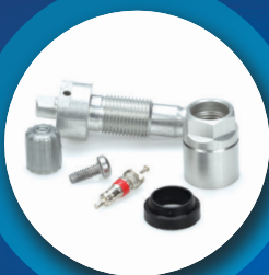
Aluminum Clamp-In #34000

Includes: plastic sealing cap, screw, brass valve core and rubber snap-in stem.