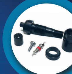
Black Anodized Aluminum Clamp-In #34010

Includes: plastic sealing cap, nickel plated valve core, aluminum clamp-in stem, hex nut, screw and rubber grommet.