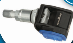
Aluminum Clamp-In #33760

Includes an adjustable angle aluminum valve stem that is rated for speeds up to 200 MPH.