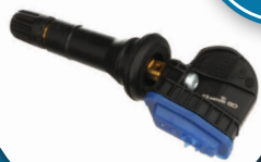
Rubber Snap-In #33560

Includes rubber snap-in valve stem, can be equipped with clamp-in aluminum stem in silver or black matte, and is rated for speeds up to 115 MPH.