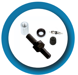
90° Black Straight Stem #25083 4 Pack #25083-4