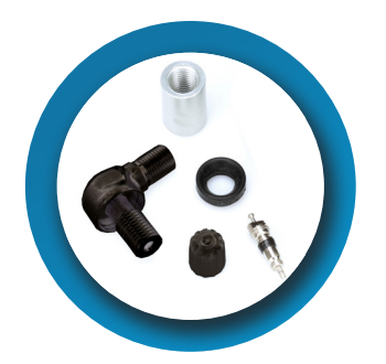
90° Black Angled Stem #25082 4 Pack #25082-4

Includes: plastic sealing cap, aluminum clamp-In stem, nickel plated valve core, nut and rubber grommet.