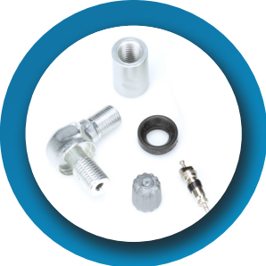
90° Aluminum Angled Stem #25078 4 Pack #25078-4

90° Aluminum Straight Stem #25080 4 Pack #25080-4